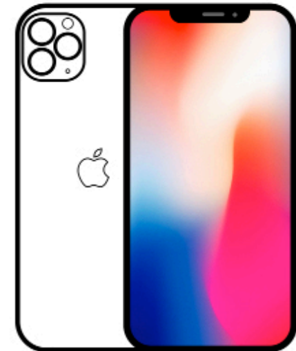
iPhone 11 Pro Max $1099