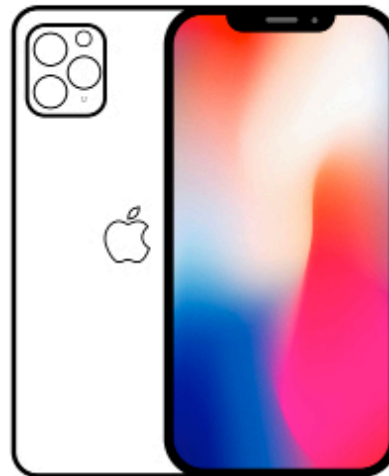
iPhone 11 Pro $999