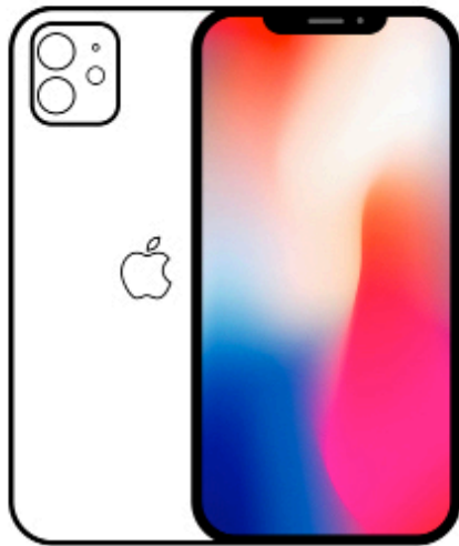
iPhone 11 $699

The most expensive iPhone from this series is the iPhone 11 Pro Max. It comes at a starting price of $1099 for the 64GB variant and up to $1449 for the 512GB variant.