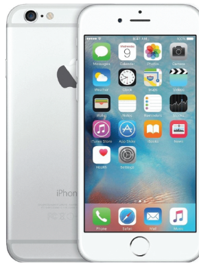
2012 iPhone 6s iOS 6 Improved Siri Eyes free Voice activated