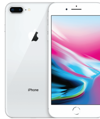
2014 iPhone 8 iOS 8 Hands off Continuity