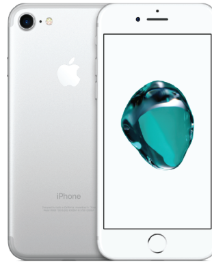
2013 iPhone 7 iOS 7 New look interface New Siri display