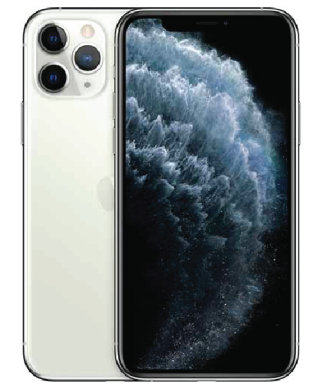
2019 iPhone 11 Pro iOS 13 Shortcuts app Accessibility & efficiency amped up