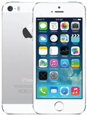
2011 iPhone 5s iOS 5 Introduced Siri to iPhone Installed and ready to go Hold down home button to activate